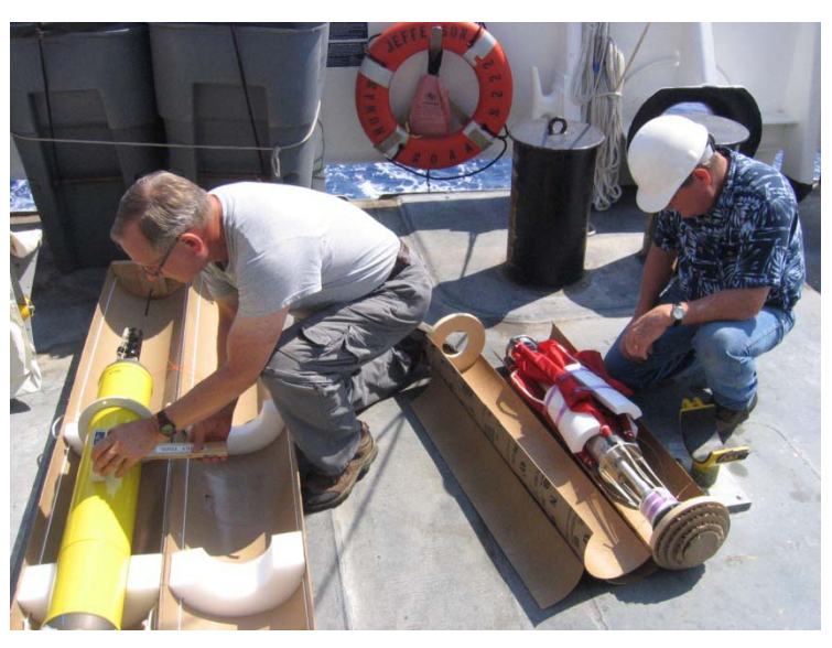
Preparing the APEX Profiling Float And Davis Surface Drifter at Site #5