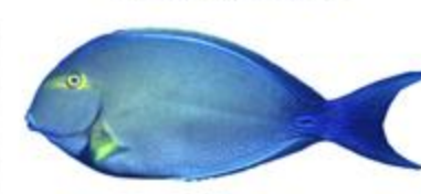
Yellowfin surgeonfish - 14" Acanthurus xanthopterus