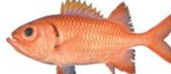
Bigscale soldierfish - 7.3" Myripristis bernäi