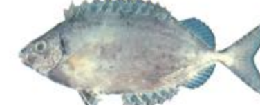
Forktail rabbitfish – 6.7" Siganus argenteus