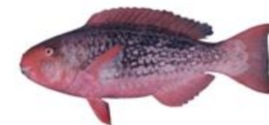
Ember parrotfish – 14.7" Scarus rubroviolaceus