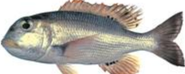
Bigeye emperor – 13.4" Monotaxis grandoculus