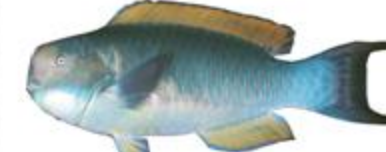
Steephead parrotfish - 12.2" Chlorurus microrhinos