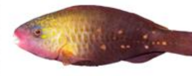
Bullethead parrotfish - 5.9" Chlorurus sordidus