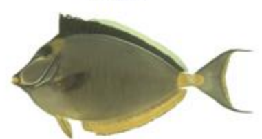
Orangespine unicornfish - 9.5" Naso literatus