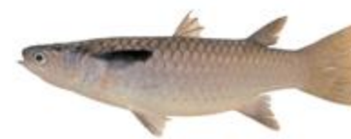
Yellowtail mullet – 14.0" Ellochelon vaigiensis