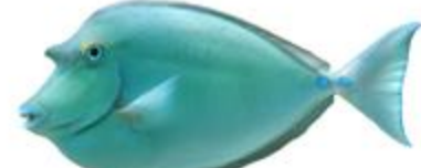
Bluespine unicornfish - 14.2" Naso unicornis