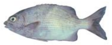
Highfin rudderfish - 11.5" Kyphosus cinerascens