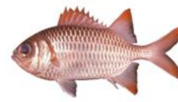
Lattice soldierfish - 8.4" Myripristis violacea