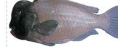
Humphead parrotfish - 21.7" Bolbometopon muricatum