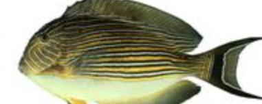
Bluebanded surgeonfish – 5.7" Acanthurus lineatus