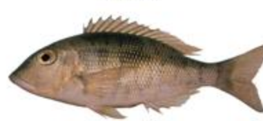
Blackspot emperor – 8.2" Lethrinus harak