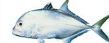
Giant trevally – 28.4" Caranx ignobilis