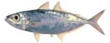
Bigeye scad – 7.4" Selar crumenophthalmus