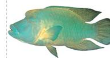
Humphead wrasse – 20.5" Cheilinus undulatus