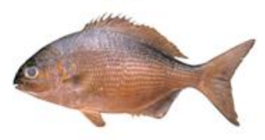
Lowfin rudderfish - 15.4" Kyphosus vaigiensis