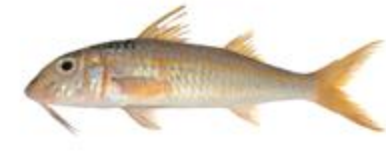
Yellowstripe goatfish – 7.7" Mulloidichthys flavolineatus