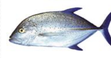
Bluefin trevally – 13.8" Caranx melampygus