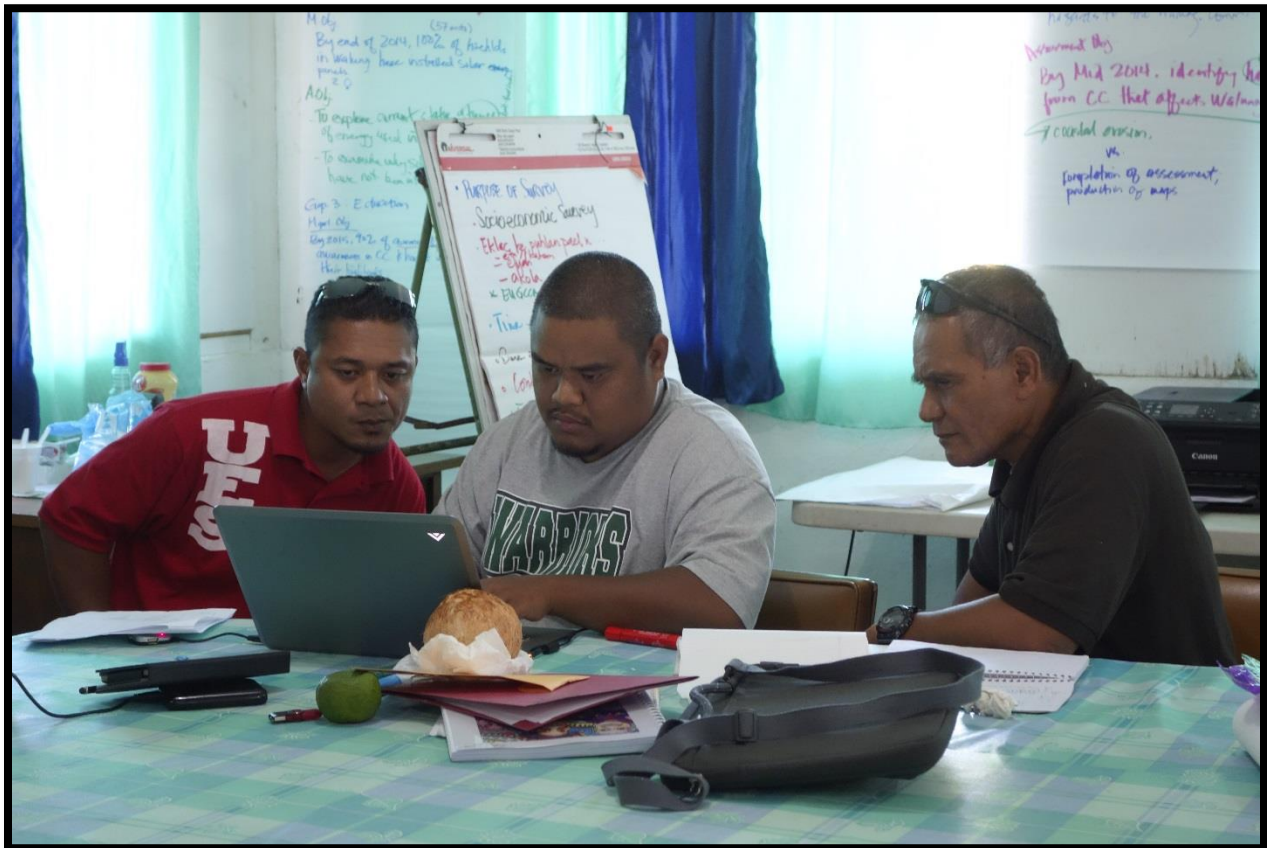
Team members work together to prepare community presentation

The training was also host to the launching of the Micronesia Challenge socioeconomic indicators. During the workshop the MC indicators which were selected at the First MC SE Measures Meeting held in Palau in 2012 were field tested for the first time.