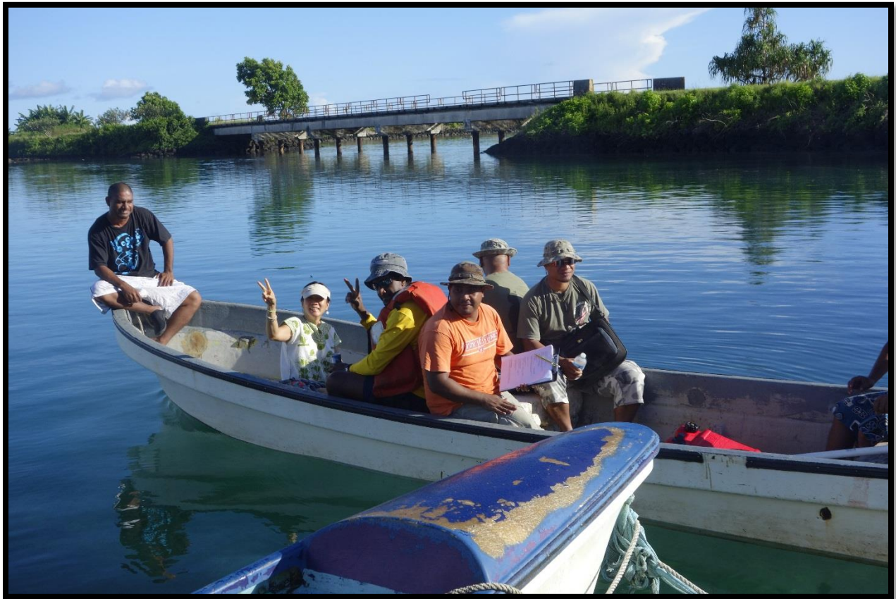
Team heads to Walung to conduct household surveys