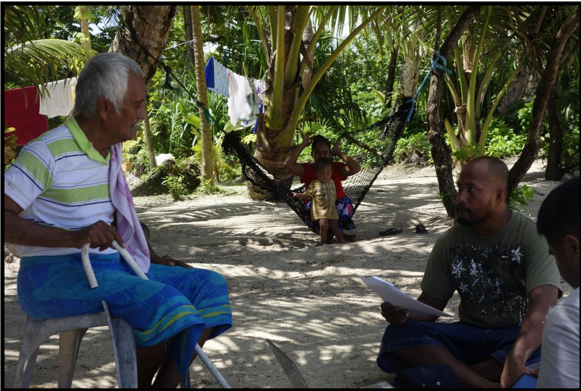
Workshop participants interview Walung community member

After identifying objectives and indicators the Kosrae team developed questions to ask key informants and focus groups. With the help of the councilman from Walung, the team identified several community members, youth, resource managers, and other individuals who were thought to have information that would provide important insight into the situation at the site. Key informant interviews were held in Tofol and in Walung. Unfortunately due to miscommunication and short notice the team was unable to hold a focus group.