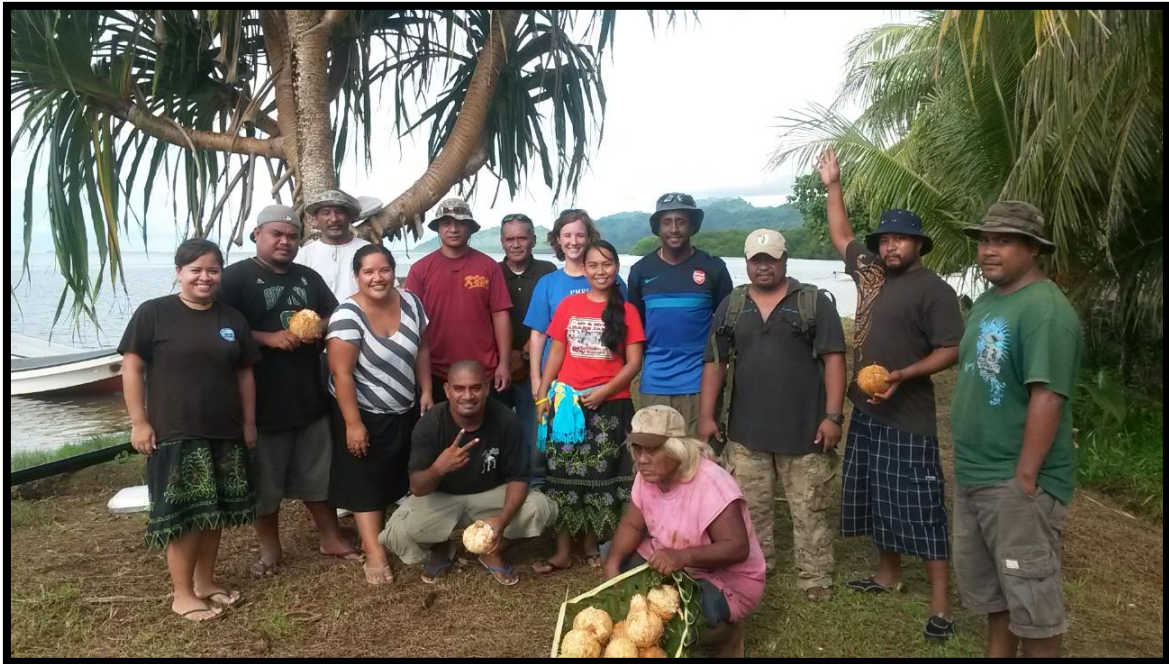
Kosrae SEM-Pasifika Team at Walung after the community presentation

Kosrae is a state within the Federated States of Micronesia. The total population of Kosrae is 6,616. Walung, which is part of the Tafunsak municipality, is located on the western side of Kosrae. This isolated coastal community is only accessible by boat, although there was once a road connecting it to the other parts of the island. Walung also does not have access to the island's power grid. As a result, wood fuel and kerosene are used for cooking and lighting. Walung has one public elementary school, but does not have a medical clinic. The community's population is 176 (92 males and 84 females) and there are 33 households. 1