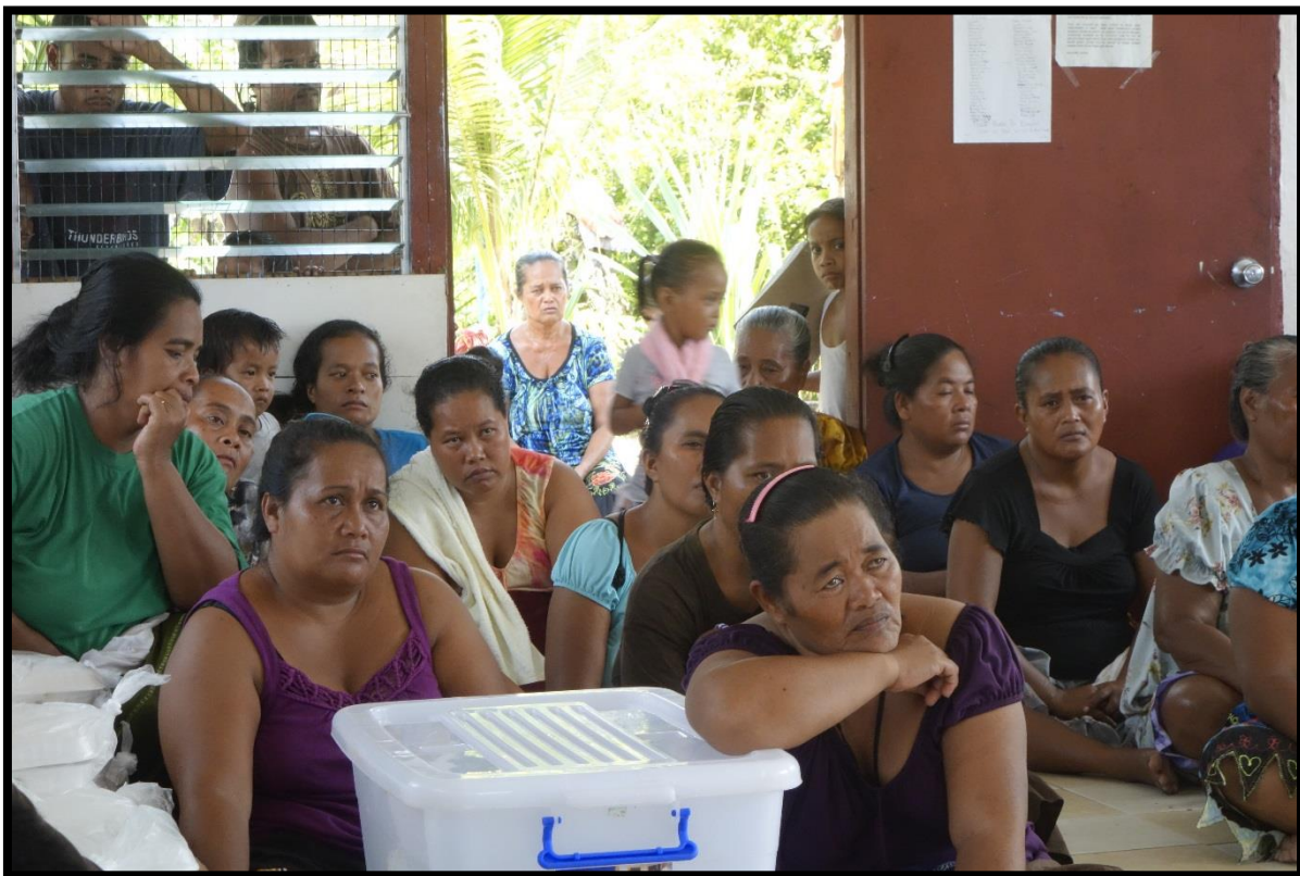
Walung community members attend final presentation

Following the survey the team designed a data entry sheet. On this sheet team members entered the data from the surveys collected. After inputting all the data the team analyzed it and selected pertinent information to report back to the community. The group then developed a presentation to take to Walung for a final visit to share the information gathered with the community. Over forty community members attended the presentation and listened as the team used both Power Point and printed materials to communicate the results. Because Walung is not connected to the island's power grid, a generator was hooked up to the community center where the presentation was conducted.