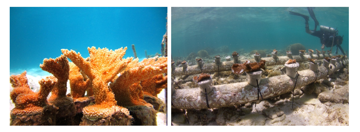
Figure 4: Example of A. palmata being grown out blocks in St. Croix, USVI and PVC tubes in Guanica, Puerto Rico.

Because of the vertical growth of A. palmata , this species is not typically grown out on line nurseries. Once A. palmata fragments are brought back to the nurseries, they are attached to structures in the nursery where they are allowed to recover. These structures typically include blocks and PVC tubes. After a year in the nursery, new growth on these colonies can be used for creating additional colonies for outplanting. This typically involves cutting tissues into 2-4 cm wafers, attaching them to a cement puck, allowing them to grow in the nursery for 1-2 years and then outplanting these colonies onto the reef (Figure 4). Another option is that the fragments can be brought into the nursery, fragmented immediately, attached to pucks and then grown out for either outplanting and/or used for nursery expansion.