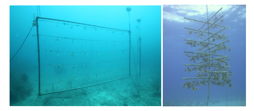
Figure 3: Photos showing a typical 5' x 10' line nursery set up (left) and a tree (right).

Once at the nursery site, collected A. cervicornis fragments are mounted on a variety of structures to promote growth and survival. Traditional methods included blocks, wire cages, and A-frames, but nurseries throughout the region are switching over to floating line nurseries which include "Floating Underwater Coral Arrays" (FUCAs), Tables or Trees (Figure 3). Line nurseries have been shown to promote higher survival and growth rates compared to their benthic counterparts (Griffin et al., 2012). There is also less disease due to the lack of predators on line nurseries and better water circulation. Line nurseries are also durable during storm conditions and have withstood swells of at least 20 feet. Line nurseries have been used for years all over the world, and to date, there have been no incidents of entanglement with sea turtles, manatees or other marine species. Because of the low maintenance required for line nurseries, operational funds can focus outplanting and nursery expansion.